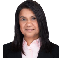
Chief Customer, Revenue and Business Development Officers